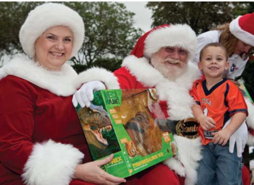
Operation Homefront strives to help families in need, especially during the holidays.

Another of the programs Operation Homefront supports is Wounded Warriors. By providing short-term transitional family housing for wounded veterans, the organization is able give a select few a free place to live while they make the transition from military to civilian life.